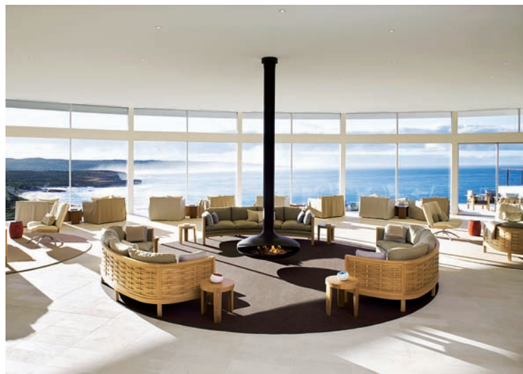
Right the Great Room at Southern Ocean Lodge; there is a colony of sea lions on Kangaroo Island

Bridge & Wickers (bridgeandwickers.co.uk) can tailor-make a two-week South Australia stay, including four nights on KI, return flights from Heathrow, and six days' car hire, from £5,150pp